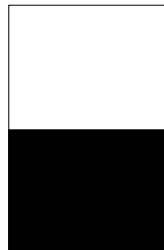
4.25X5.5 HALF PAGE